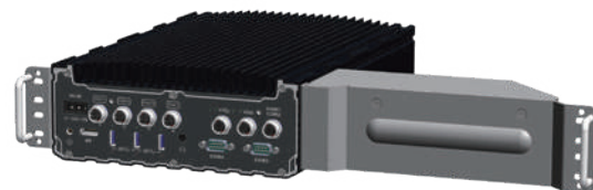
▲ SEMIL 19" rack-monuted