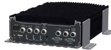
▲ SEMIL wall-mounted